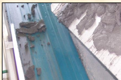
Band conveyor of dewatering sludge