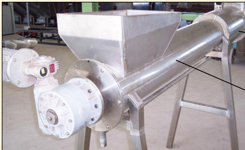
screenings Compressor type RGP-240