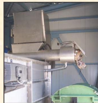
rejection compressed screenings