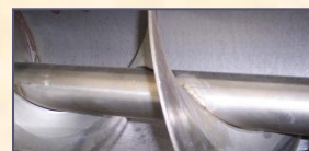
Screw conveyor and compression